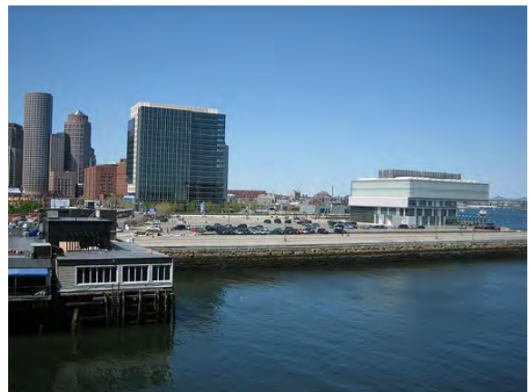
View of Boston skyline from the Seaport Hotel conference location. The Institute of Contemporary Art is pictured on the right.

Conference website and photographs can be found at http://www.arlisna.org/news/conferences/conf_index.html