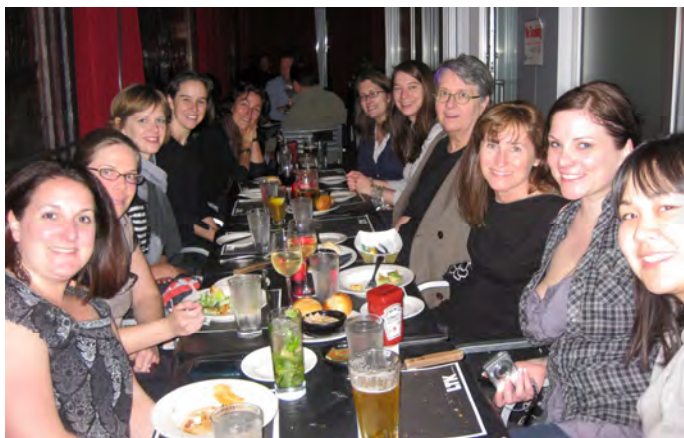
An evening out at Legal Test Kitchen with ARLIS/SC & ARLIS/NC members