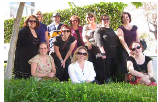
At Schindler's Mackey Apartmentmmts

On June 18 , members spent a half day together. The day began with lunch in Culver City followed by a visit to the Center for Land Use Interpretation for a tour and to see the exhibition. The next destination across town was the Mak Center. Members took a tour of the Schindler House at the Mak Center , followed by a tour of the Mackey Apartments a short distance away. Center for Land Use Interpretation www.clui.org and the Mak Center www.makcenter.org .