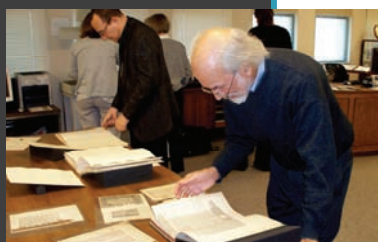
Exploring Special Collections at SDSU